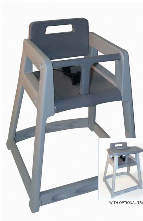
WITH OPTIONAL TRAY