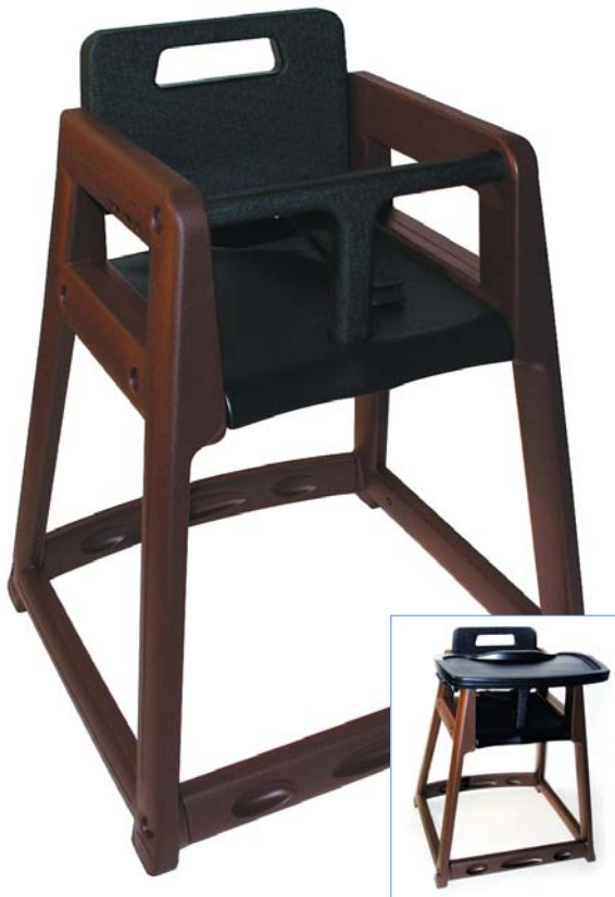
WITH OPTIONAL TRAY